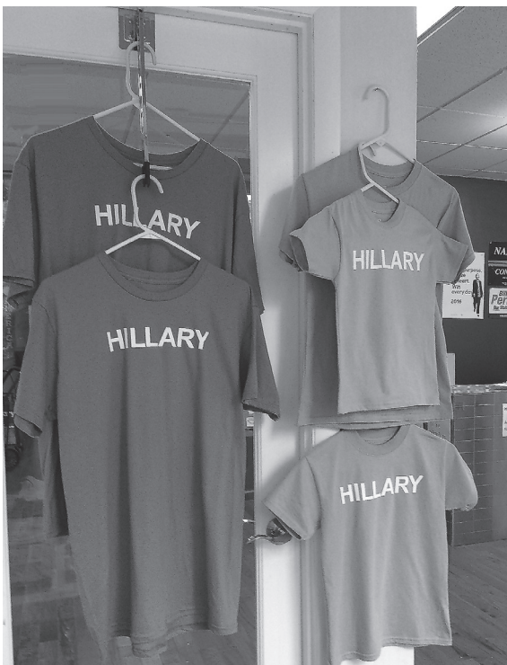
T-shirts: $12 adults & $10 kids