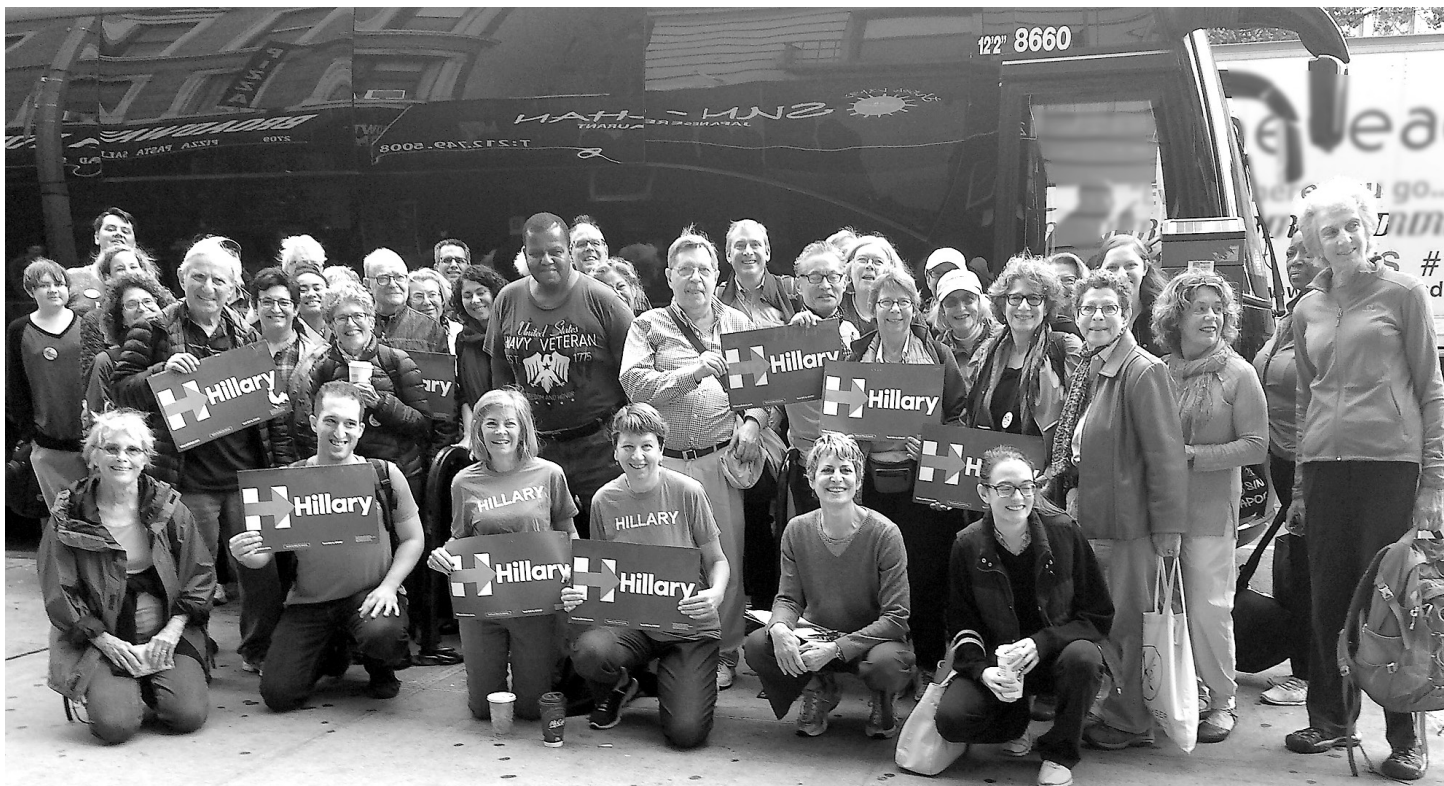
Volunteers on their way to canvass in Pennsylvania