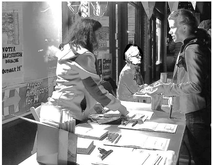
Volunteers of all ages solicit donations for buttons and help register voters at the Center