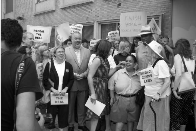
Protest at Jewish Home – Saturday August 15

On August 12, 2009, the management of the Jewish Home and Hospital (JHH) announced a land swap of their property on 106 th street for a parcel on 100 th street in Park West Village. This land swap enables the JHH to build a much taller and larger nursing home than they agreed to build in the negotiated zoning carve out in 2007.