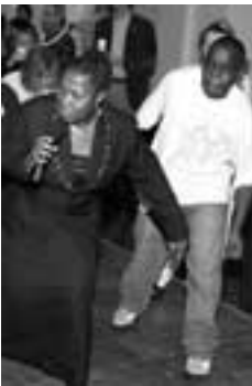
Line Dancing with the DJ