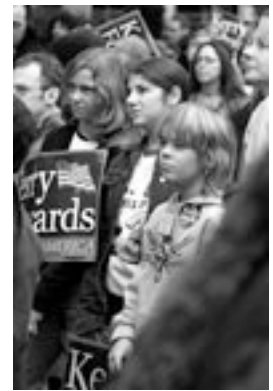
Kids for Kerry