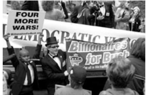
Billionaires for Bush perform