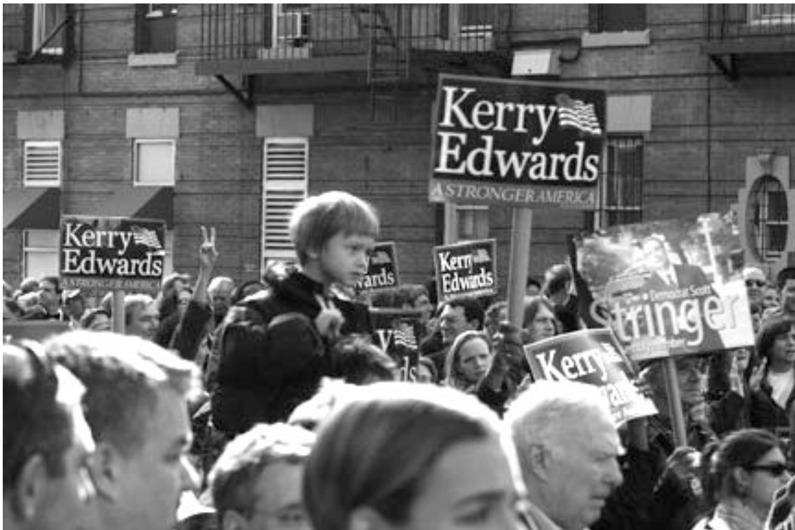
Kerry/Edwards Rally at Straus Park October 23, 2004

Three Parks Independent Democrats Cathedral Station P.O. Box 1316 New York, NY 10025